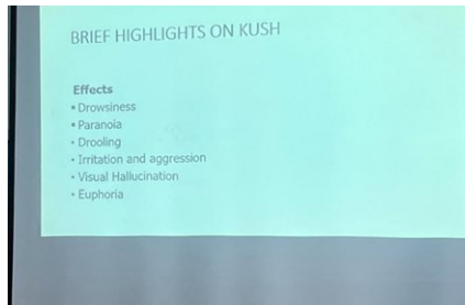
Health Ministry Holds Emergency Meeting on KUSH Crisis