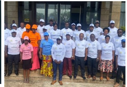
MoHS Celebrates World Antimicrobial Awareness Week