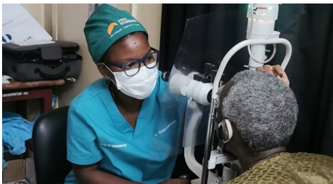
National Eye Care Programme to Perform Free Corneal Transplants