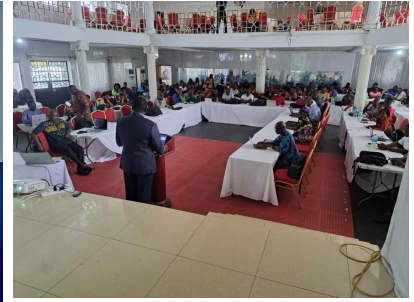
DPPI Conducts Health Data Review Meeting