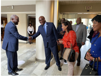
Ministry of Health & Sanitation Hosts Delegates from the Susan Thompson Buffett Foundation & Equity Group Holdings