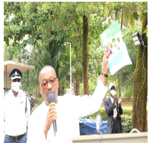
HE Vice President Dr. Juldeh Jalloh, Launched Sierra Leone's 2021-2030 UHC Roadmap

Health security. Noting that these will form the basis on which the health sector will ride in the coming years for better patient health outcomes.